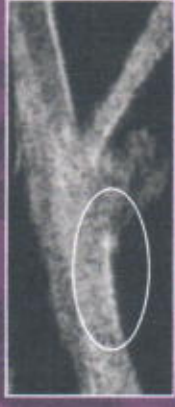
Post Treatment with MP3. No detectable evidence of tissue damage.