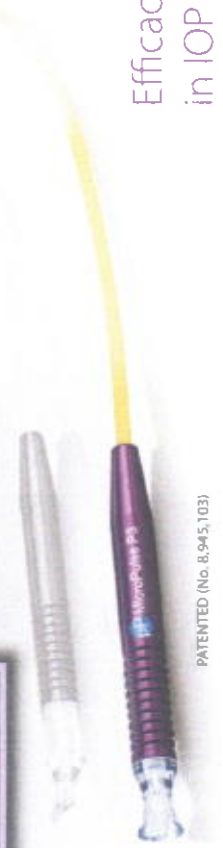
PATENTED (No. 8,945,103)