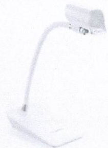
NAVI-FS Fixed Support