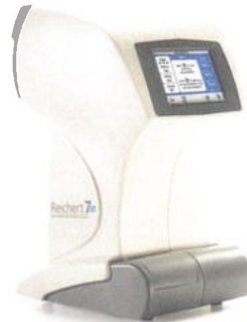
Reichert 7CR Auto Tonometer + Corneal Response Technology