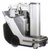
MOBILE DIGITAL RADIOGRAPHY X-RAY